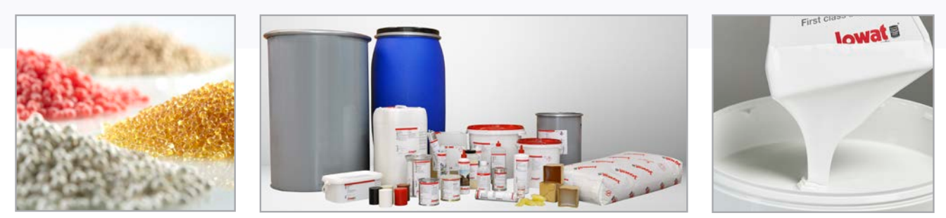
The information given in this leaflet is based on test results from our laboratories as well as on experience gained in the field, and does in no way constitute any guarantee of properties. Due to the wide range of different applications, substrates, and processing methods beyond our control, no liability may be derived from these indications nor from the information provided by our free technical advisory service. Before processing, please request the corresponding data sheet and observe the information in it! Customer trials under everyday conditions, testing for suitability at normal processing conditions, and appropriate fit-for-purpose testing are absolutely necessary. For the specifications as well as further information, please refer to the latest technical data sheets.

Jowal Subsidiaries Distribution Partners